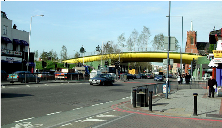
The Green Bridge

The Green Bridge, designed by Piers Gough, spans the Mile End Road and can be easily identified from Mile End Tube station. The original planting scheme was for Silver Birch and Black Pines to be set in grass with a footpath and cycle path running through the centre. The trees are effectively planted in large containers that are plunged into the polystyrene that fill the bridge, and as such must be treated as containerised plants.