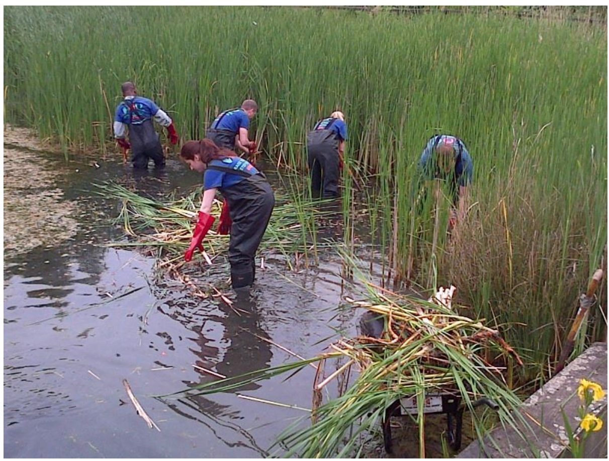
Corporate Volunteers from a bank helping with maintenance in the Ecology Lake, Summer 2015