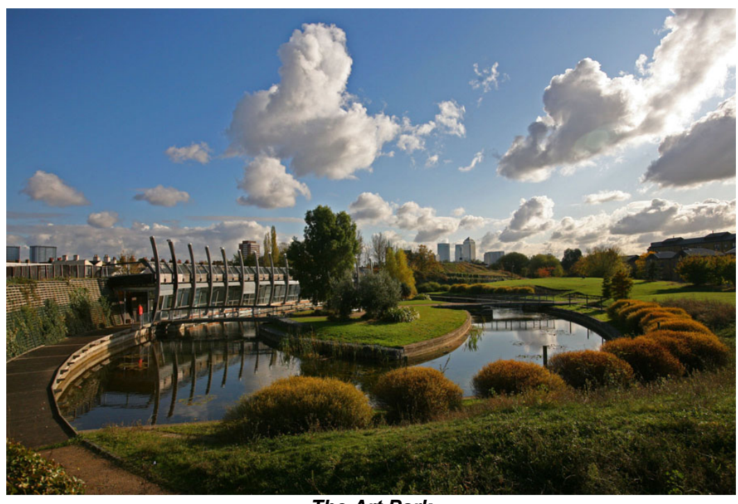
The Art Park

A large pond with cascades, islands, bridges and the Art Pavilion itself dominates the Arts Park. Further south is a partially planted small hill known as the Art Mound, affording views across the Park. A set of giant grass steps provides an energetic method of reaching the top, but a path around the mound allows for a far gentler ascent. There are beds of imaginative planting that afford interest throughout the year to the front of the Pavilion. To the rear of the Art Pavilion, the globular line of willows has been removed and replaced with a series of new beds planted to provide year round interest.