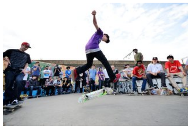
The Skate Park

The area is designed to appeal to those between the age of 11 and 17. It takes as its' starting point that it is impossible to provide a single piece of equipment that would be of interest to both ends of this age range, so instead of providing a range of equipment, one core item has been provided as a bigger and more challenging version of that in the Children's Play Park for the under 11s. From this the younger children can observe the etiquette of this play space and gain confidence before venturing onto the less familiar equipment. The other basis of the design is that most young people in this age group tend to want places that they can sit and chat, away from adults.