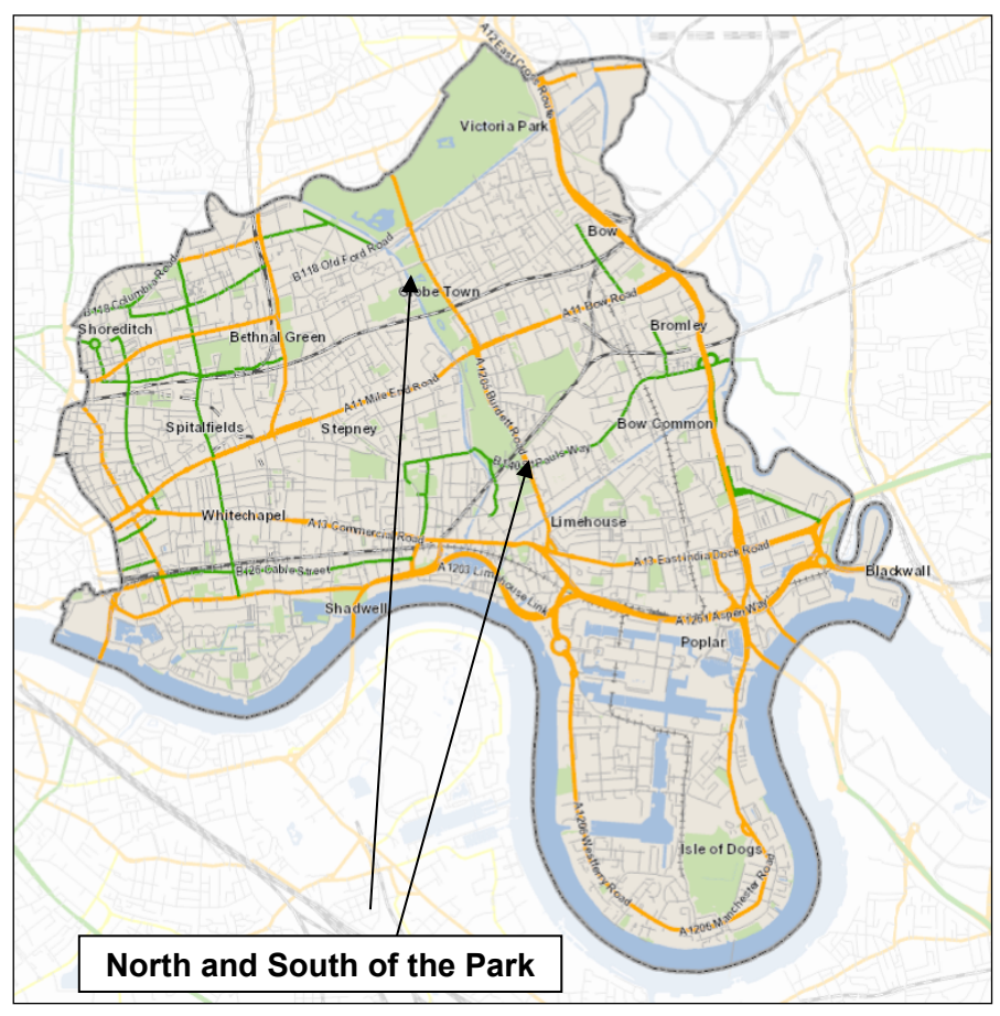
Map of Tower Hamlets illustrating location of Mile End Park (North and South)