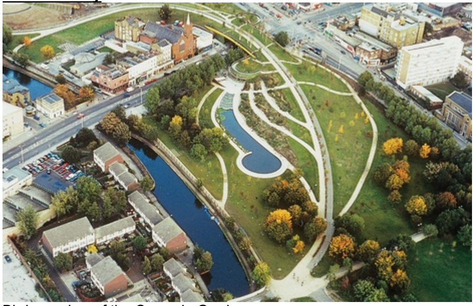
Bird eye view of the Cascade Garden