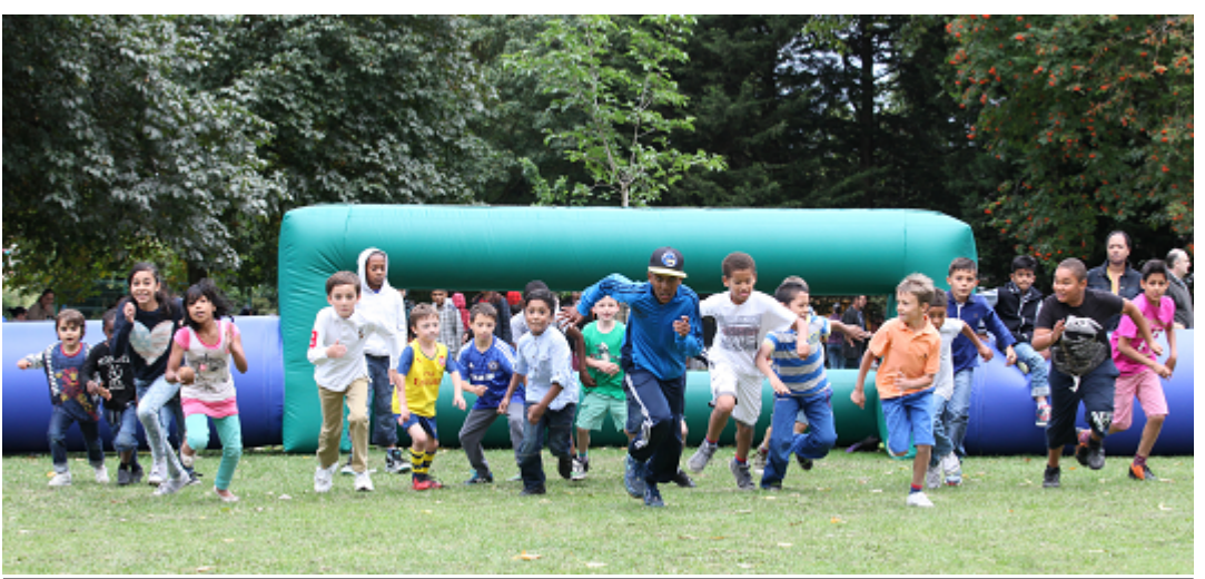
Sporting Festival, Summer 2016