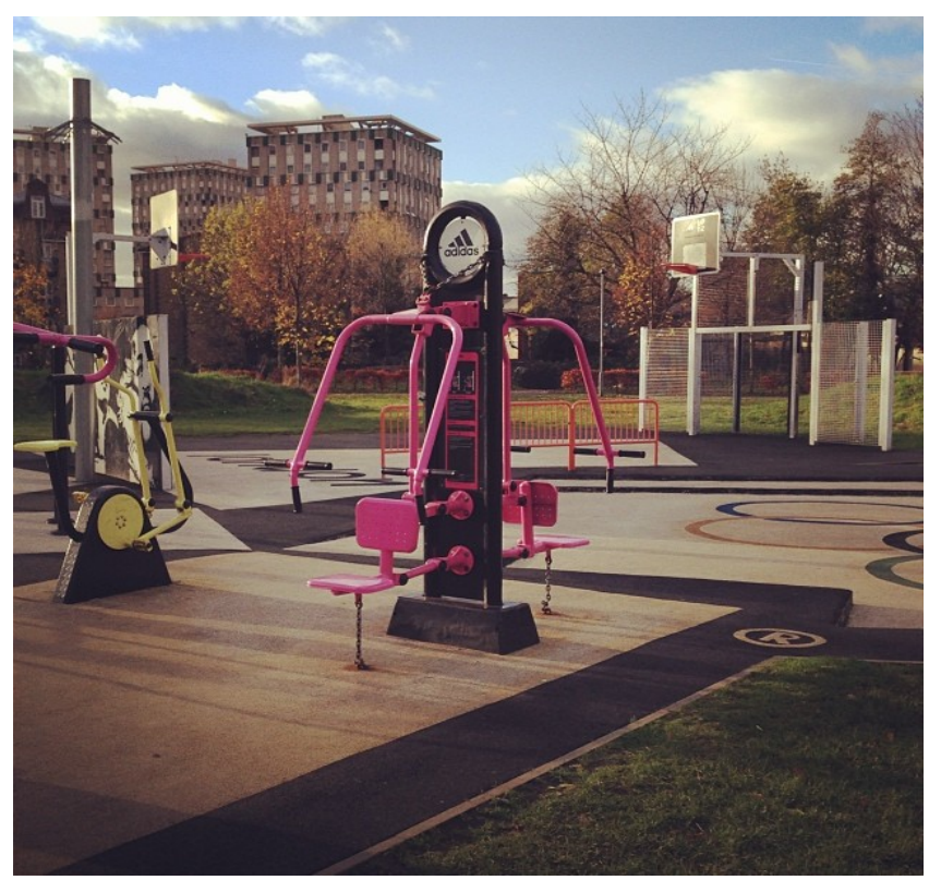
The Adizone, Wennington Green