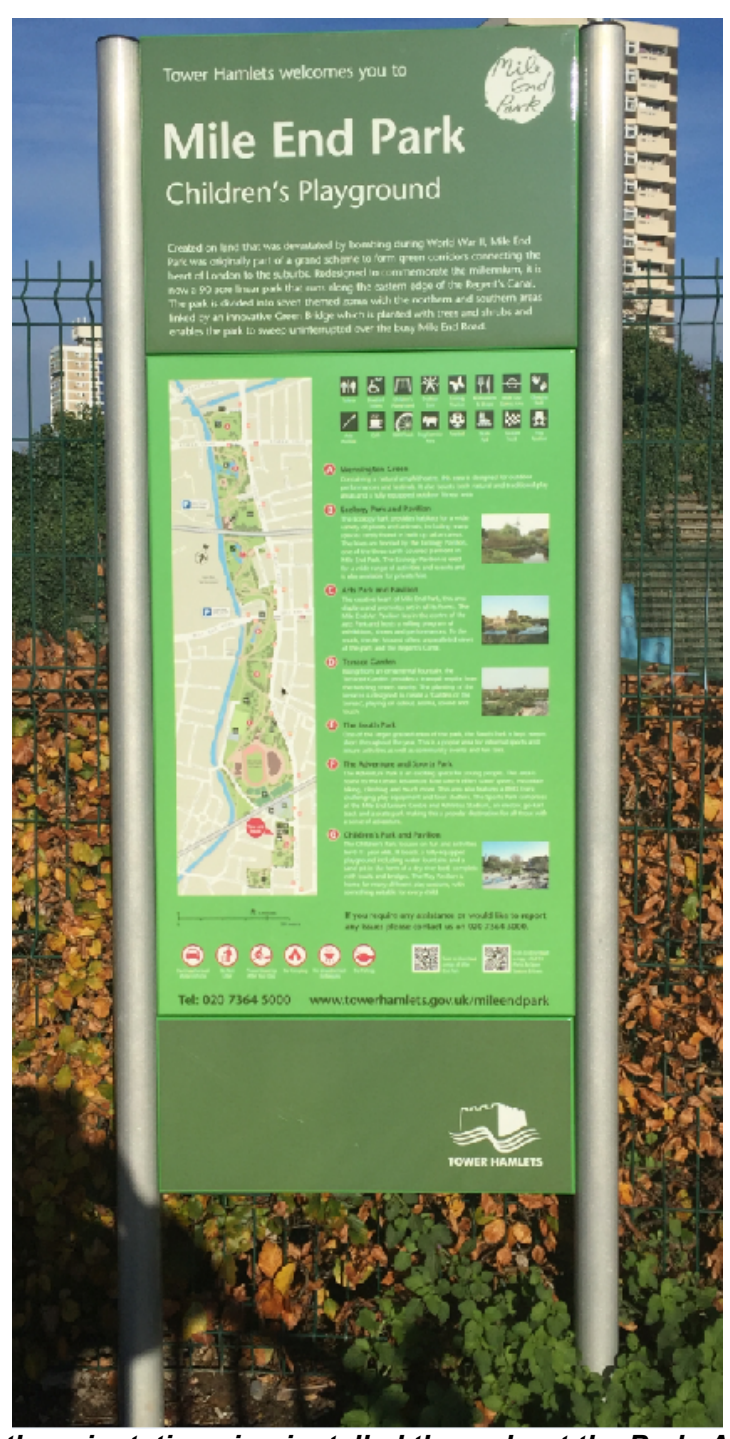
An example the orientation sign installed throughout the Park. All signs have description of the section of Park in which the signs have been installed. The above sign in particular is located outside the Children's Playground.