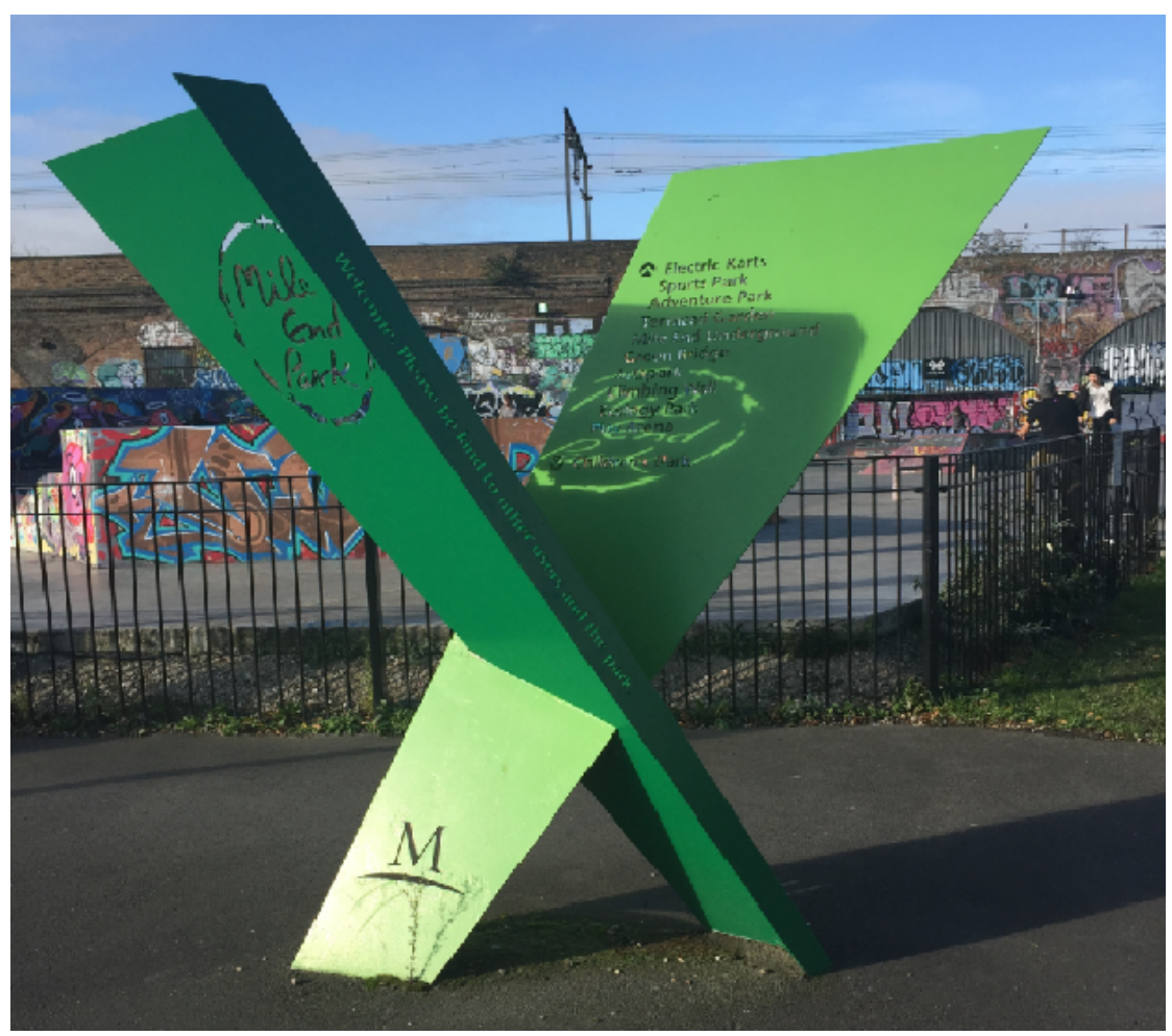
The 'X' were installed across the Park during the Park's first phase of redevelopment in 2000. The signs were funded by the Millennium commission and act as orientation signs, as well as welcome sign.

During summer of 2015 ten orientation signs were installed across the stretch of the Park. Although there was a need for signage identified from local users, this had been further reiterated by the Green Flag judges some years ago and therefore has been on the Park's wish list as priority. By identifying funds from Section106 it was finally possible to develop and install these signs.