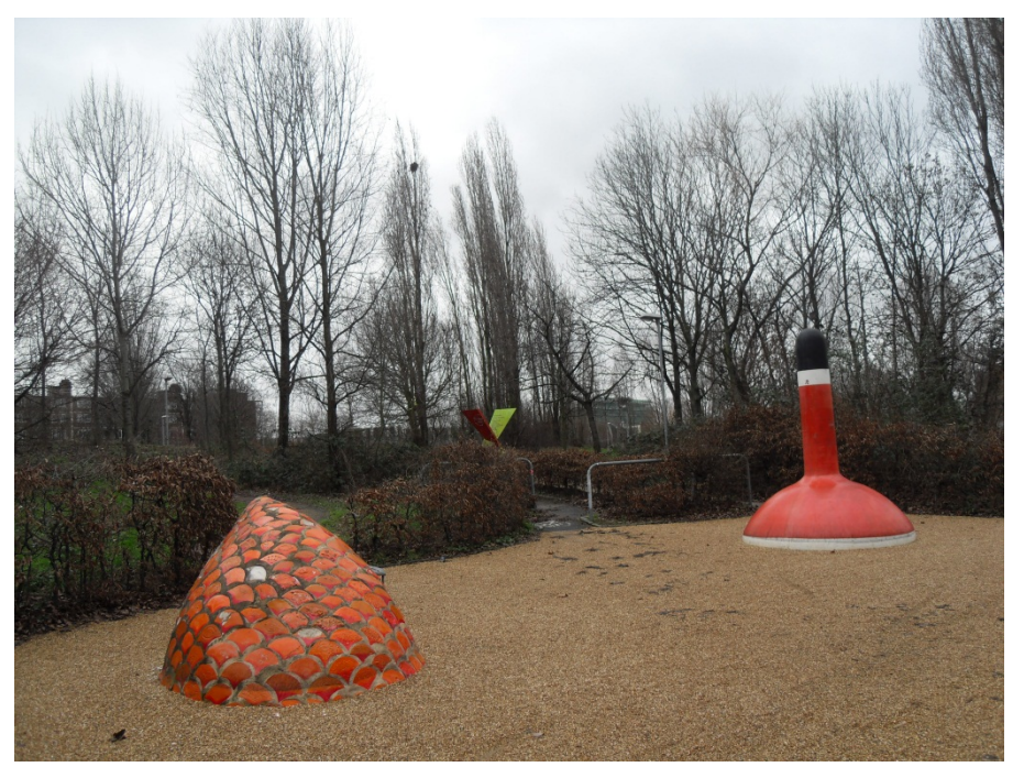
Fishy Places, off Regents Canal