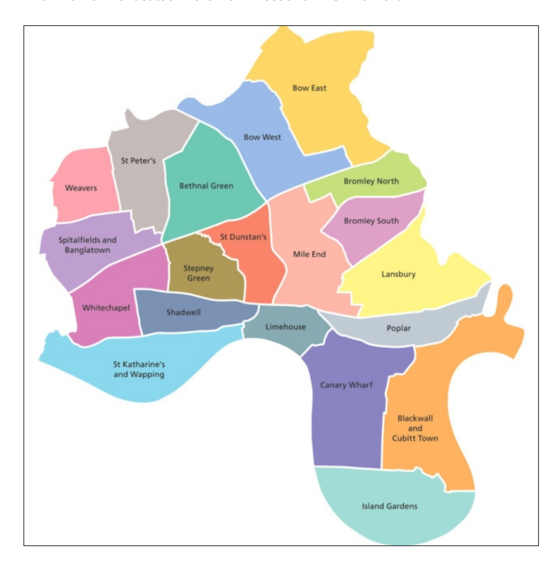
Electoral wards for the borough of Tower Hamlets. The Park is located on the Bow West and Mile End ward.

Mile End Park is located in the Bow West and Mile End ward.