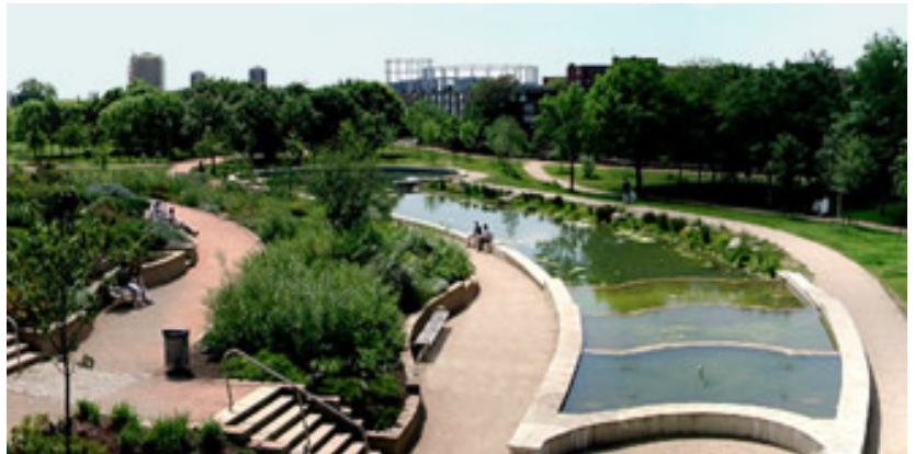
The Terrace Garden

The Terrace Garden is a series of terraces leading down from the bridge on the southern side to the pool and fountain. Each terrace is planted to maintain year-round interest and is supplied with formal steel seats. The water feature has a fountain at one end and five burbling jets at the other. Water travels from one end to the other down a cascade, so providing the noise of running water in the area. The far side of the feature is less formal and reeds and other natural aquatics have been allowed to establish.