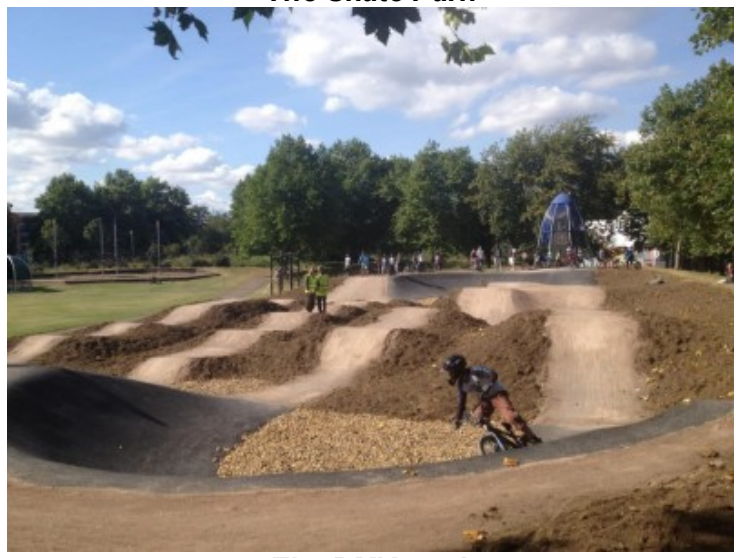
The BMX track