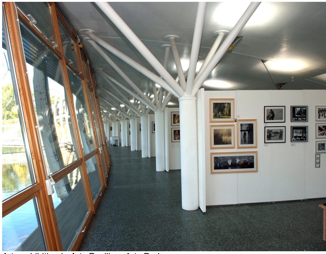
Arts exhibition in Arts Pavilion, Arts Park