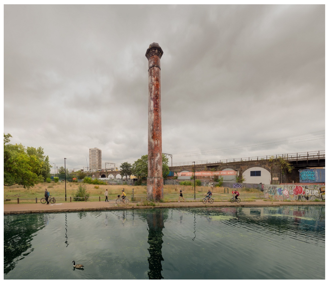
Brick Sewer Ventilation Shaft in Kirk's Place

The Regent's Canal, although strictly speaking not a part of the Park, does have a symbiotic relationship with the Park that should be recognised and celebrated.