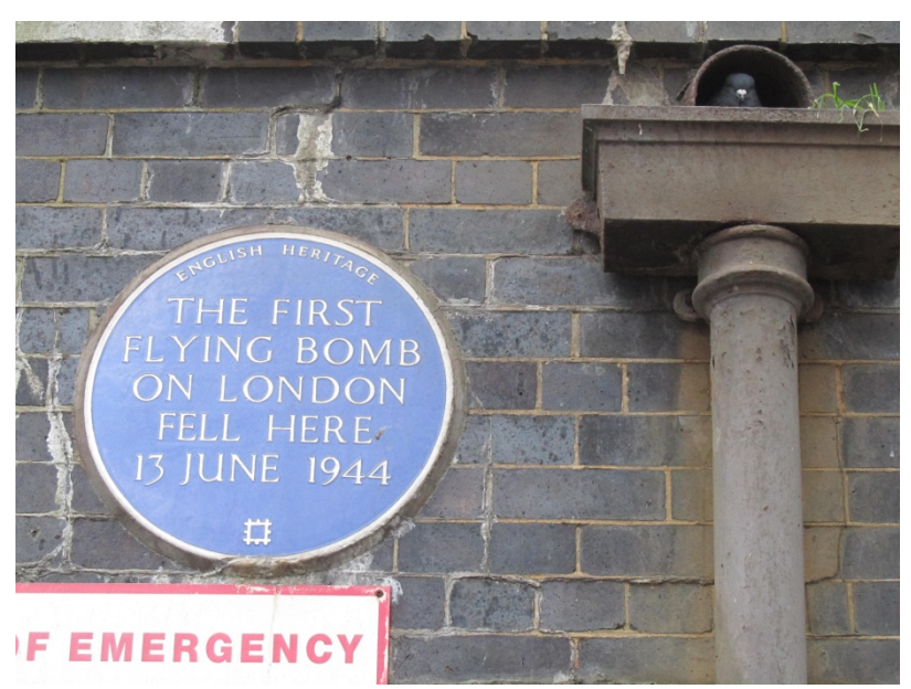
Located on the railway Arches in Burdett Road, just off Mile End Park Haverfield Green (Ecology Park)

A plaque just outside the Park on the Railway Bridge on Grove Road commemorates the place that the first V2 bomb landed in London. This has been incorporated into an information panel in the Park to highlight the very real sacrifice made by the people living in this area during the Second World War.