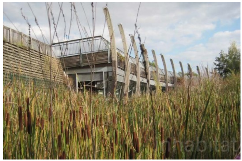
The Ecology Park