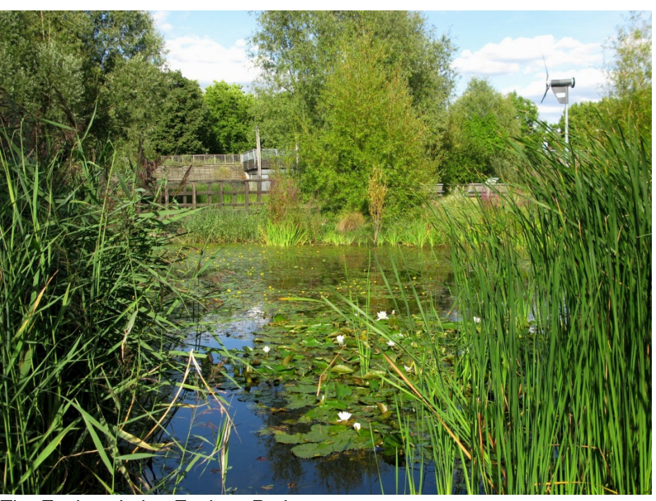
The Ecology Lake, Ecology Park