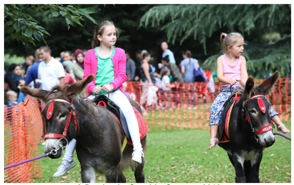
A Day by the Seaside, Summer 2016