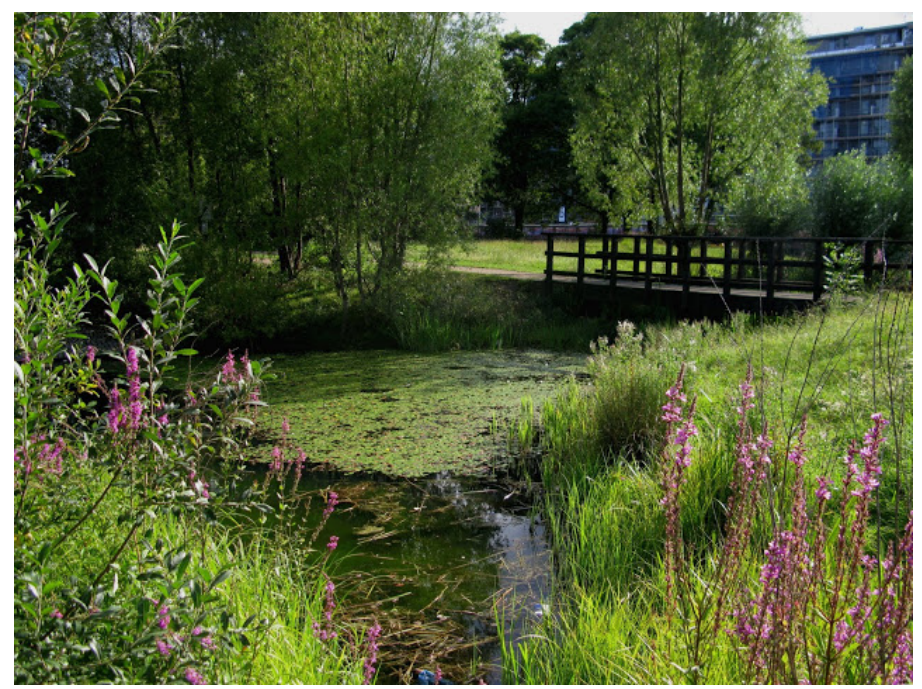
The Ecology Lake, Ecology Park