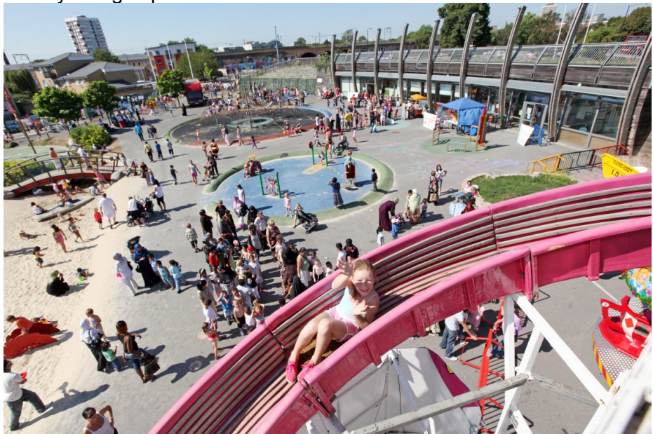
Bird's eye view of the children's playground during a summer event in 2013

From January 2017, the playground has been fully open to the public after a series of improvement and renovation works. This includes new play equipment, landscaping, ground games marking and improved site security.