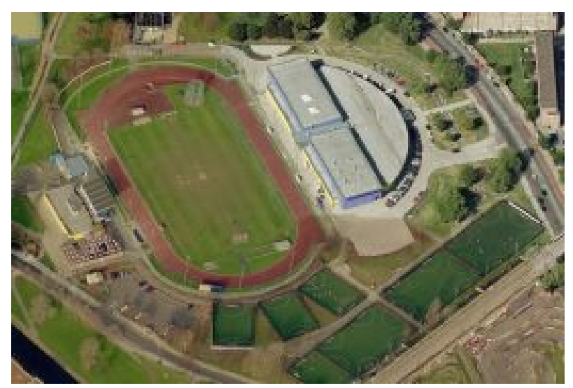
GLL Sports Stadium and Leisure Centre

To provide a wide range of sporting activities within the Park, building on the already successful athletic track and all-weather sports pitch. The activities are designed to be accessible to a wide cross section of the community, and have the promotion of healthy lifestyles as a core objective.